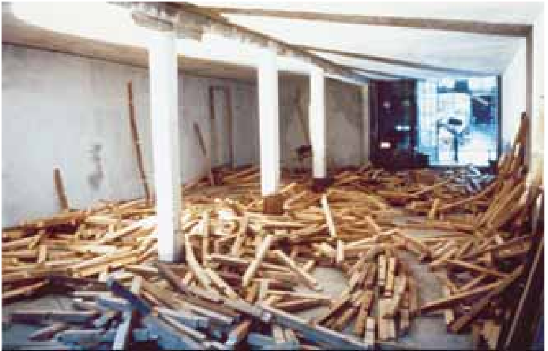
Bonaccini-Fohr-Fourt, Das Kapital, sans titre 9 (construisons-nous notre destruction), 1994